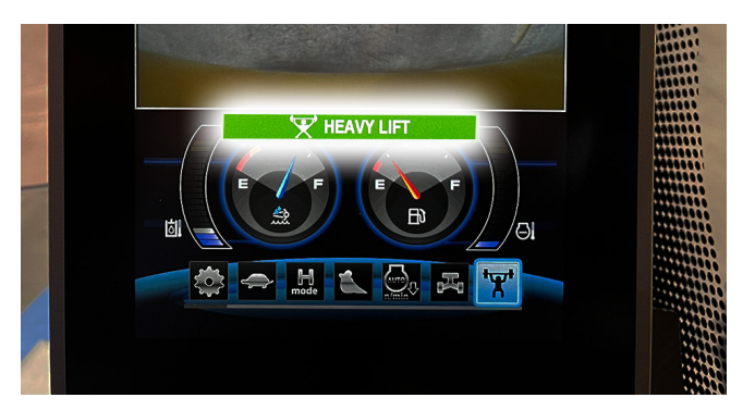
HEAVY LIFT MODE 10% more hydraulic pressure (Heavy Lift) means greater lifting power. Not available in the SK 130LC-11