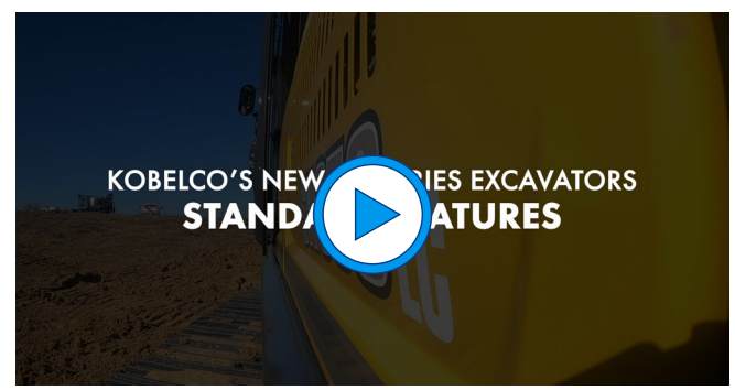
STANDARD FEATURES KOBELCO - 11 s give you more features from the start.