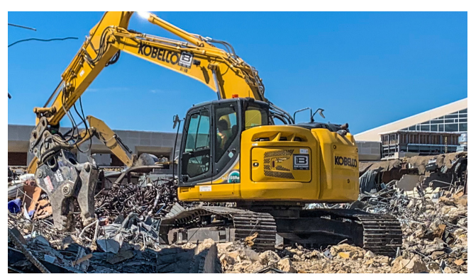
*See component coverage listing for all covered items See terms and conditions for details.

The KOBELCO Premium Protection Plan (KPPP) allows you to customize coverage to fit your needs and budget. Choose from full extended base coverage or PT+HYD component coverage* for both new and used machines. When you purchase KPPP for your excavator, you're managing the cost of unexpected repairs after the standard warranty period expires. Should you need repairs, you'll deal directly with your nearest KOBELCO dealer to facilitate the repairs quickly using original OEM parts.