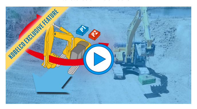
INDEPENDENT TRAVEL With Independent Travel, safely carrying a large pipe across a job site is a breeze.

UNLIMITED POWER BOOST When you need more power instantly, engage Power Boost to get 10% more power. Not available in the SK 130LC-11